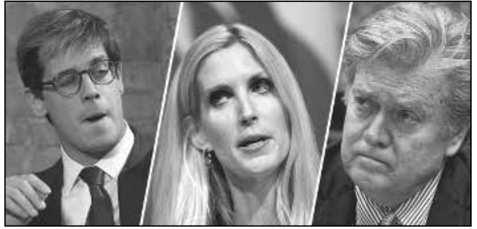
Media figures Yiannopoulos, Coulter & Bannon promote white supremacy.

CSUF erected fencing surrounding the TSU building. Dozens of University police, local police, and sheriff deputies were present in riot gear with them horse-mounted detachments, K-9 units, and multiple helicopters. Some had shields. They arrested eight people, including two members of the anti-fa group Joe