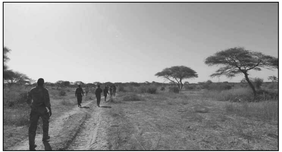
A U.S. Army Green Beret patrols with Nigerian soldiers during a training exercise in February 2017.

Our long-term vision is to enable and support our