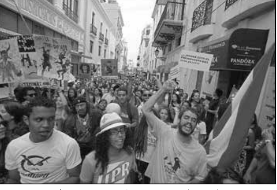
University of Puerto Rico students in Rio Piedras striking against austerity imposed by US colonial PROMESA Fiscal Control Board.

Yet, what makes this strike different from others is its "multi-sectoral struggle", as the leaders of the movement refer to it. The students' claims go beyond the spectrum of the university, and as their demand #3 shows, they are asking for a complete audit of Puerto Rico's debt before the country continues signing checks to bondholders without even having a clue of what are they paying for. The type of pressure that the students are employing for an audit and