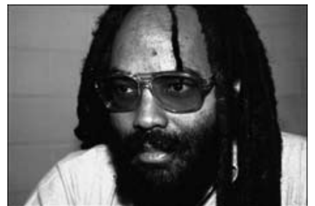
Mumia Abu-Jamal is a political prisoner and Black journalist, supporter of MOVE and former Black Panther on Death Row in PA. Write him:

Mumia Abu-Jamal AM-8335 SCI Greene 175 Progress Dr. Waynesburg PA 15370 www.FreeMumia.com Audio at: http://www.prisonradio.org