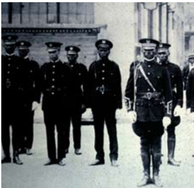
Garvey's militia, 1920

Garvey's Black Legion wore military clothing, trained openly in military drills, and carried long swords publicly whenever it was legal to do so. It was an aboveground apparatus. When the US government's secret police force, known as the Federal Bureau of Investigation (FBI), recognized the threat of the Black Legion , Marcus Garvey was one of the first blacks put on the dangerous subversive list. The US government's secret war plan called Counter Intelligence Program (COINTELPRO) was originally created to target him and his organization. COINTELPRO's insidious use of legal and illegal tactics to disrupt and neutralize Garvey's "Back to Africa" movement consisted of informants, agent provocateurs, attempted assassinations, and bogus trumped up charges against innocent Black people in the UNIA.