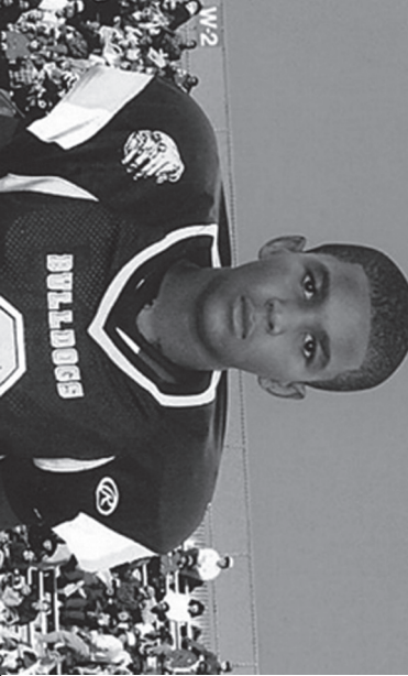
Trayvon Martin, killed by racist vigilante in Sanford, FL, February 2012.