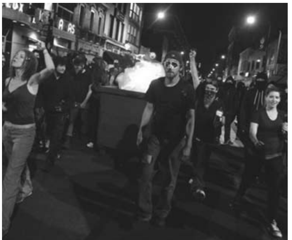
G-20 protesters light up the night in Pittsburgh demonstration against the globalized bailout of capital on the backs of poor and oppressed people.