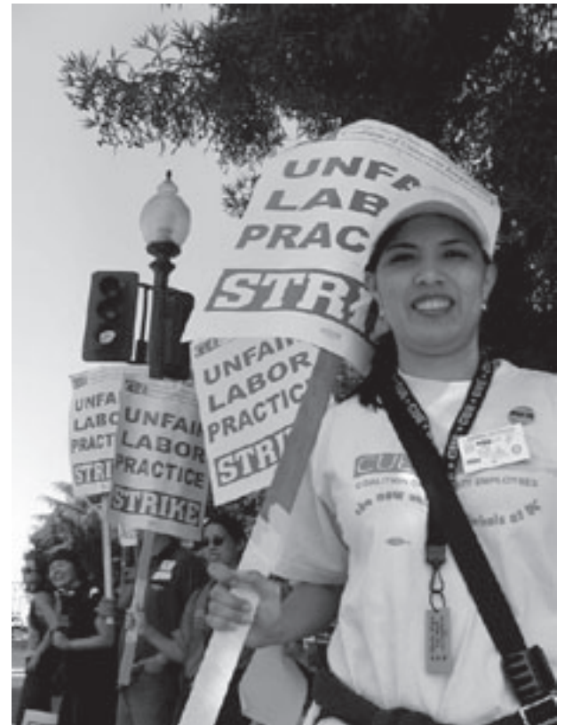
Women workers still struggle for justice today.

This was the turning point of the strike. Protests from every part of the country reached Congress. In March, a House Committee heard testimony from Lawrence strikers including girls under 16. The young workers testified that the companies held back a week of their wages, required -5- them to do unpaid clean-