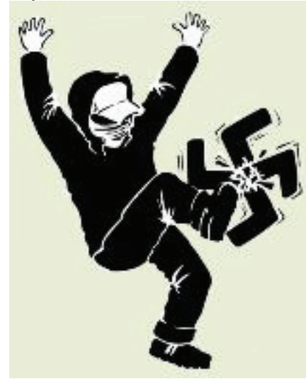
BASH THE FASH!

We will be back to Caffarella's neighborhood in the very near future. In the meantime, we will continue publicly outing all of the other Philadelphia members of the Keystone State Skinheads.