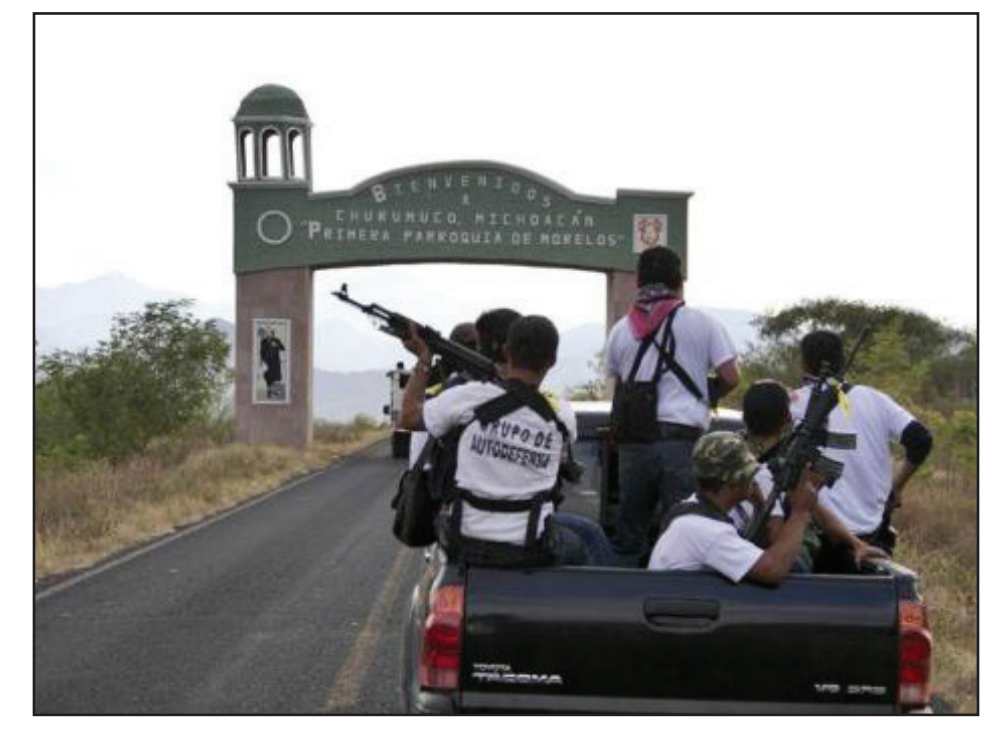
Armed self-defence groups in Michoacan retake a town from Narcos.