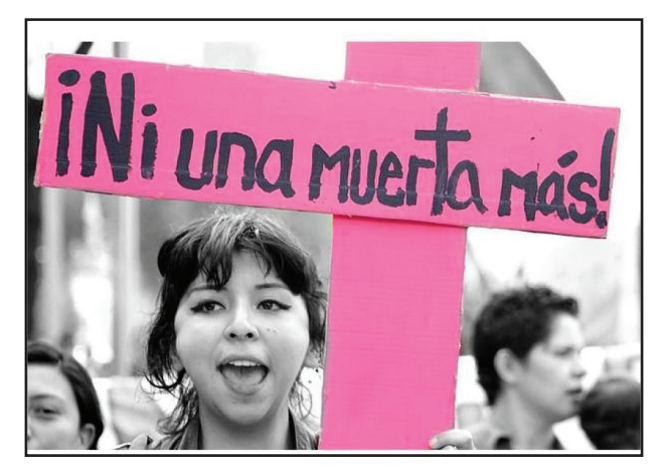
been apprehended? I have yet to really feel that the most

solution. When women's bodies are so disfigured, nipples cut or bitten off, vaginas torn and signs of torture for days before death, one has to wonder what kind of monsters are we dealing with? Have any of these heinous killers