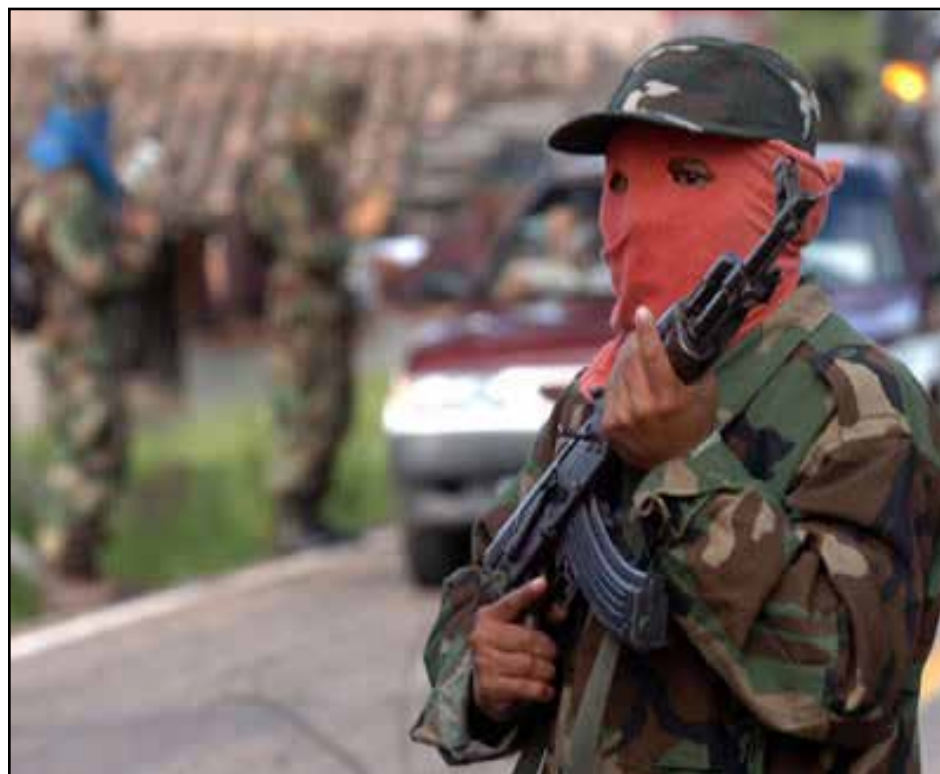
Guerrilla Fighter of the Ejercito Popular Revolucionario (EPR).

We are talking about the creation and performance of a mercenary army nurtured by former police officers at all levels, former military demobilized ex-professional military and federal police on