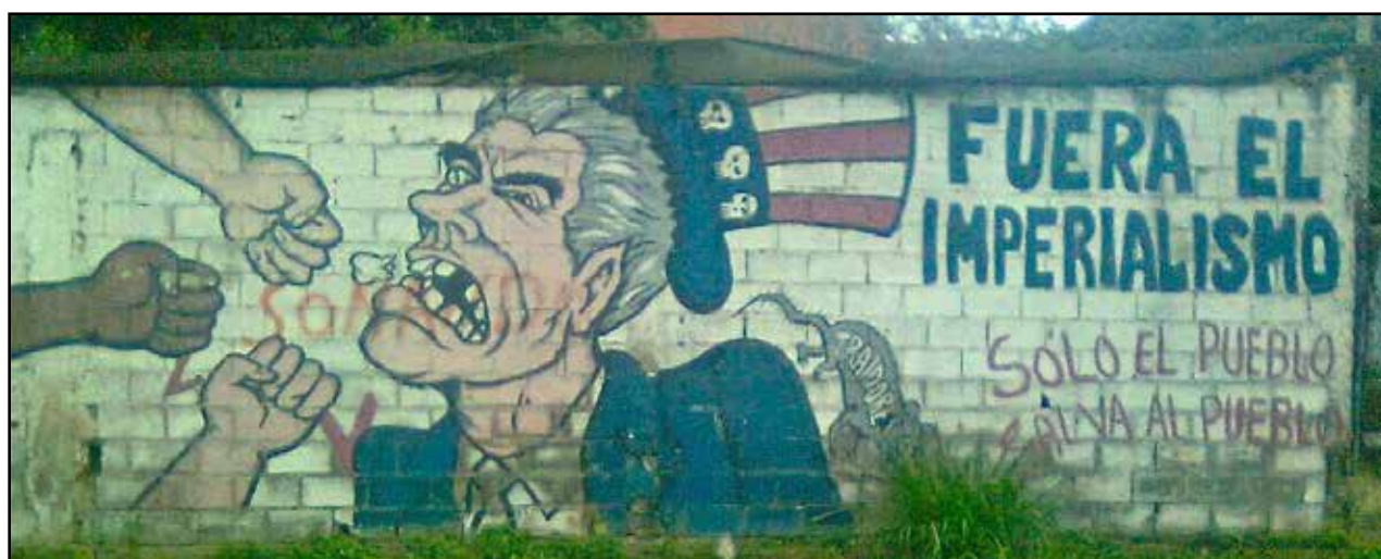
Street art in Venezuela: "IMPERIALISM OUT! Only the people can save the people".

So far, the vast majority of Venezuelan people, especially African Descendants and Indigenous people, have rejected both the politics and strategy of the counter-revolutionary movement. A Bloomberg News article reported a bus driver's observation, "It's rich people trying to get economic perks. The slums won't join them." It's time we stand in solidarity with the majority in Venezuela and voice strong opposition to US-sponsored coups or intervention on the side of the counter-revolution.