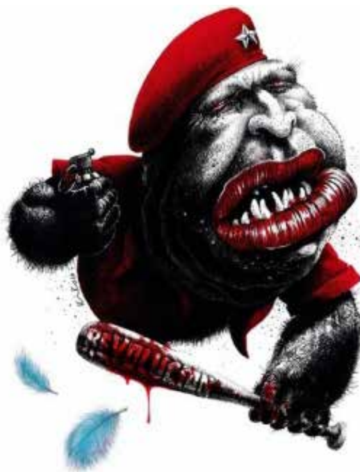
Racist political cartoon representing Hugo Chavez as a murderous ape.

The roots of white supremacy run deep, yet the Boli-