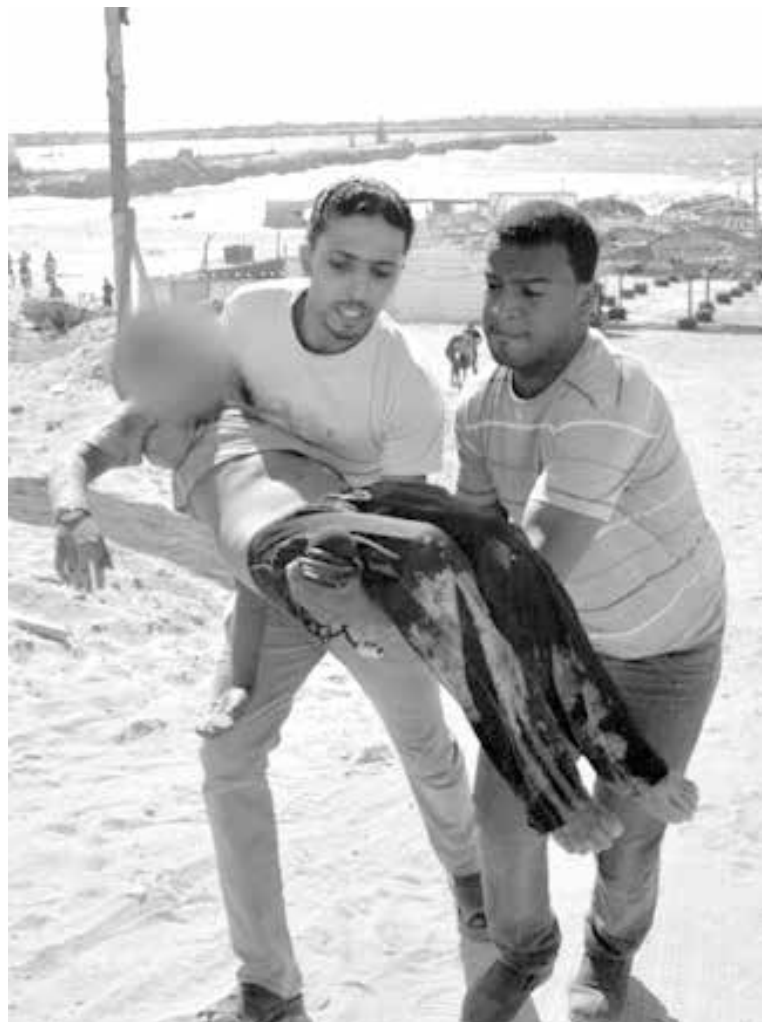
Left: One of four Palestinian youths killed on a beach in Gaza by shelling carried out by an Israeli military vessel.

Palestinian General Federation of Trade Unions University Teachers' Association in Palestine Palestinian Non-Governmental Organizations Network (Umbrella for 133 orgs) General Union of Palestinian Women Medical Democratic Assembly General Union of Palestine Workers General Union for Health Services Workers General Union for Public Services Workers General Union for Petrochemical and Gas Workers General Union for Agricultural Workers Union of Women's Work Committees Pal-Cinema (Palestine Cinema Forum) Youth Herak Movement Union of Women's Struggle Committees Union of Synergies-Women Unit Union of Palestinian Women Committees Women's Studies Society Working Woman's Society Press House Palestinian Students' Campaign for the Academic Boycott of Israel Gaza BDS Working Group One Democratic State Group