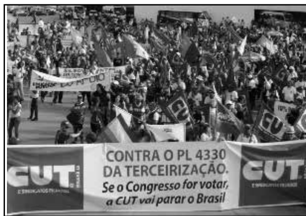
Left, labor and popular movements protest against austerity measures in Brazil, April 2015.

The Movimento dos Trabalhadores Sem Terra, or MST (the Landless Rural Workers’ Movement), was created in 1984 to address inequalities in rural areas (caused by 500 years of monoculture) by fighting for agrarian reform, collectively squatting on and farming unproductive land under the slogan “Occupy, Resist, Produce.” Due mainly to its efforts, this practice is considered legal under the 1988 Constitution (although the Constitution is frequently ignored by local governments and the judiciary in Brazil).