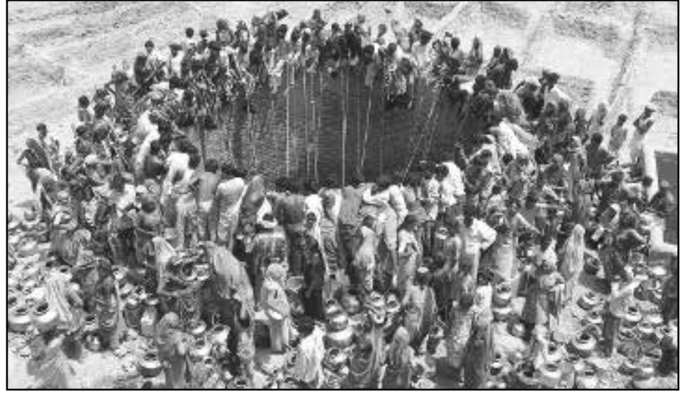
People gather in Gujarat, India to seek water from a well.

We must embrace and unite with the struggles of indigenous people around the world, including inside the so-called borders of the US to assert their sovereignty and defend the natural world. For example, the Piipaash Uumish of Maricopa Colony, AZ, recently denounced a water district proposal to install pipelines to carry