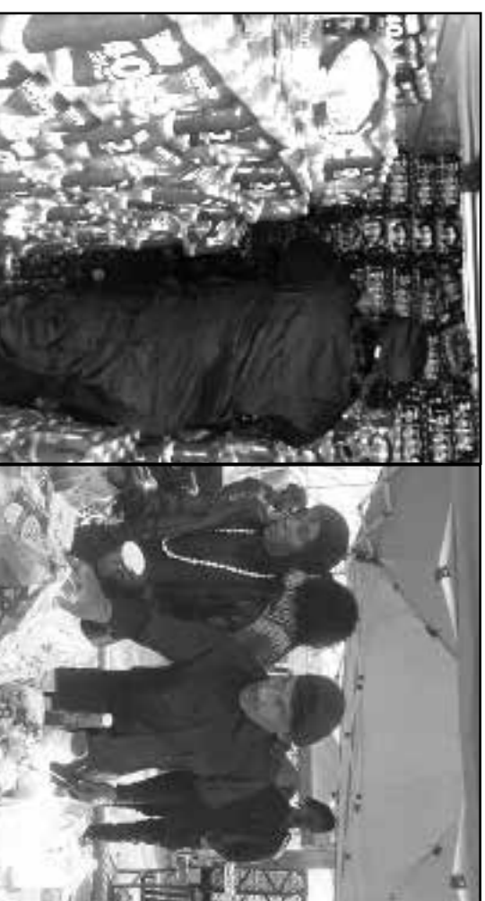
Black Riders Free Water Giveaway in Flint, Free Food Giveaway in Los Angeles

TTT published at least four times a year. No checks to Turning the Tide, please! Can't process them! Please write us every time your address changes, with your EXACT address as it should appear on the address label. TTT is a small project with few resources: we can't provide books or legal aid, or investigate individuals' innocence.