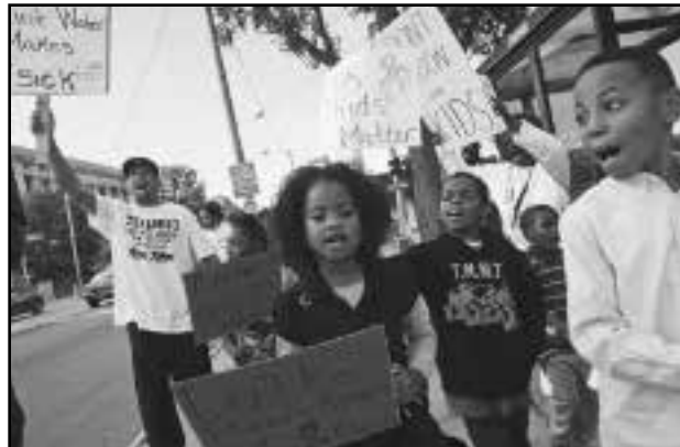
Children in Flint Michigan march in protest to demand safe drinking water.

At a succession of international conferences, the US and other Western powers turned a deaf ear to island nation peoples and those from low-lying countries like Bangladesh, warning of the deadly impact and consequences of global warming. We ignored the warning of indigenous elders from Greenland, who testified they could hear the water running beneath the island's ice sheets even during the winter. Mired in the mentality of privilege, the population in the US or Europe