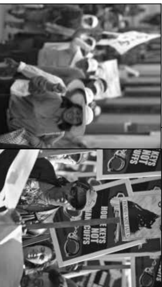
Peru peasants protest for water sovereignty, US homeless demand homes not jails