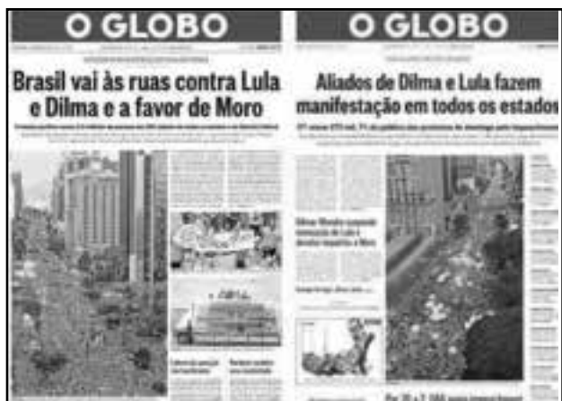
Contrasting headlines in corporate Brazilian press: Brazil takes streets against Lula & Dilma (the right); Allies of Dilma & Lula hold demonstrations (the left).

2008-2014 marked the best period in Brazilian history. Inflation ranged between 4.31-6.50%, considered optimum for an economy. The unemployment rate in 2014 was 4.8%, the lowest ever recorded. The PT passed laws requiring that 50% of all students enrolled at public universities are from low-income backgrounds and primarily Afro-Brazilian, in accordance with their representation in the population. Before PT took office, this percentage hovered around 5%. Brazil’s foreign reserves are still 10 times higher than they were before PT took office. However, the mainstream media is designed to cover up or even fabricate news.