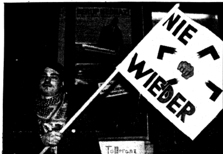
A LEFTIST demonstrator blocks the entrance to a Frankfurt, Germany, movie theater to prevent the presentation of the controversial documentary film "Career: Neo-Nazi," about a Neo-Nazi leader. About 50 protesters prevented the movie's showing. The demonstrator's flag shows a fist smashing a swastika, and a slogan reading, "Never again."

As of yet it is unclear when the actual trial will start. Heartbeats will keep you up to date with the developments around the case and we hope that it will be useful for your work as well. At a later point we might approach you with suggestions for specific solidarity actions.