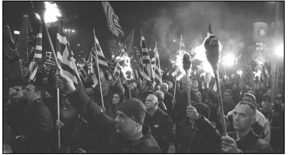
Eastern European fascists gather with torches and neo-Nazi flags & banners.

In Slovakia, the People’s Party Our Slovakia (LSNS), led by Marian Kotleba, similarly moved from the fringes to winning seats in parliament. Kotleba used to wear a uniform modeled on the militia of Slovakia’s wartime Nazi puppet state. He rails against the Roma people (AKA “gypsies”, also victims of genocide under Hitler) and is an admirer of Jozef Tiso, the Catholic priest and wartime leader who deported tens of thousands of Jews to Nazi death camps. His People’s Party-Our Slovakia got 23% of first-time voters in the last election, and took 14 seats in the 150-member parliament. Similar to Sweden, the left-wing populist Prime Minister Robert Fico had paved the way, repeatedly vowing to protect Slovakia from an influx of Muslims, saying Slovakia would take in 200 Syrian refugees, but only if they were Christians. By legitimizing