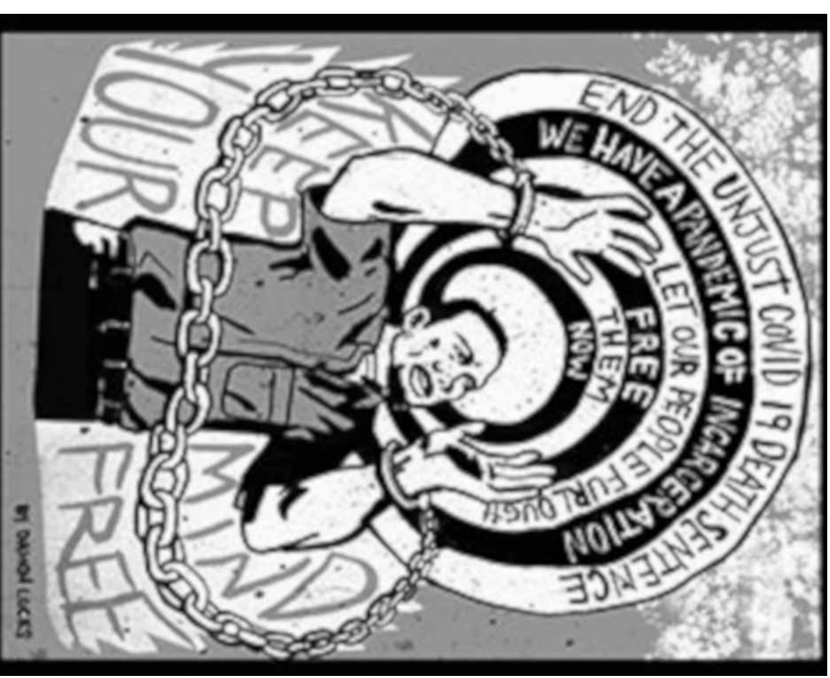
graphic from Certain Days Freedom for Political Prisoners Calendar 2021 (order inside)