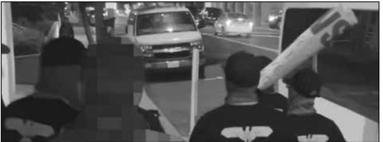
Clockwork Crew getting run out. Bystanders blurred at request of source.