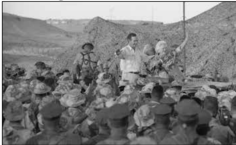
George HW Bush and Barbara Bush greeting US troops that invaded Iraq in 1990. GHW Bush said: "The Persian Gulf crisis has forged a new world order in which the superpower adversaries of the Cold War now stand united..."

The analogies of Iraq to Hitler are laughable. Hitler rose to power in an advanced, industrial country with an imperial history. He enjoyed the support of the other imperial powers so long as his ambitions were directed against the "inferior" Slavs and the commies. Significant sectors of the rulers and the societies of the countries he