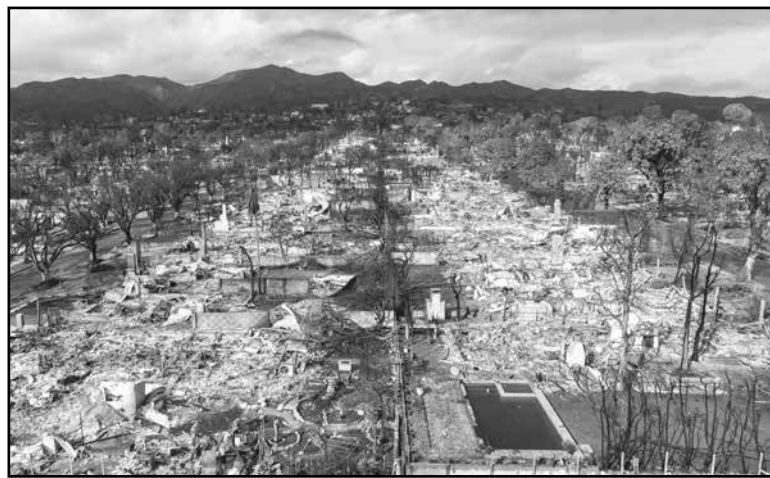
Destruction of the "alphabet streets" in Pacific Palisades, LA.

Principles must be upheld to guide us and that process, such as that housing is a human right, that decolonization is an imperative, and that, as in the Reconstruction after the US Civil War, democratic empowerment is the basis and bedrock of an effort to rebuild. The rebuilding process can be a laboratory for initiatives in social, economic and racial equality. We must assert the primacy of the public good and the commons, and prioritize redevelopment that is in harmony with and helps regenerate the natural physical environment.