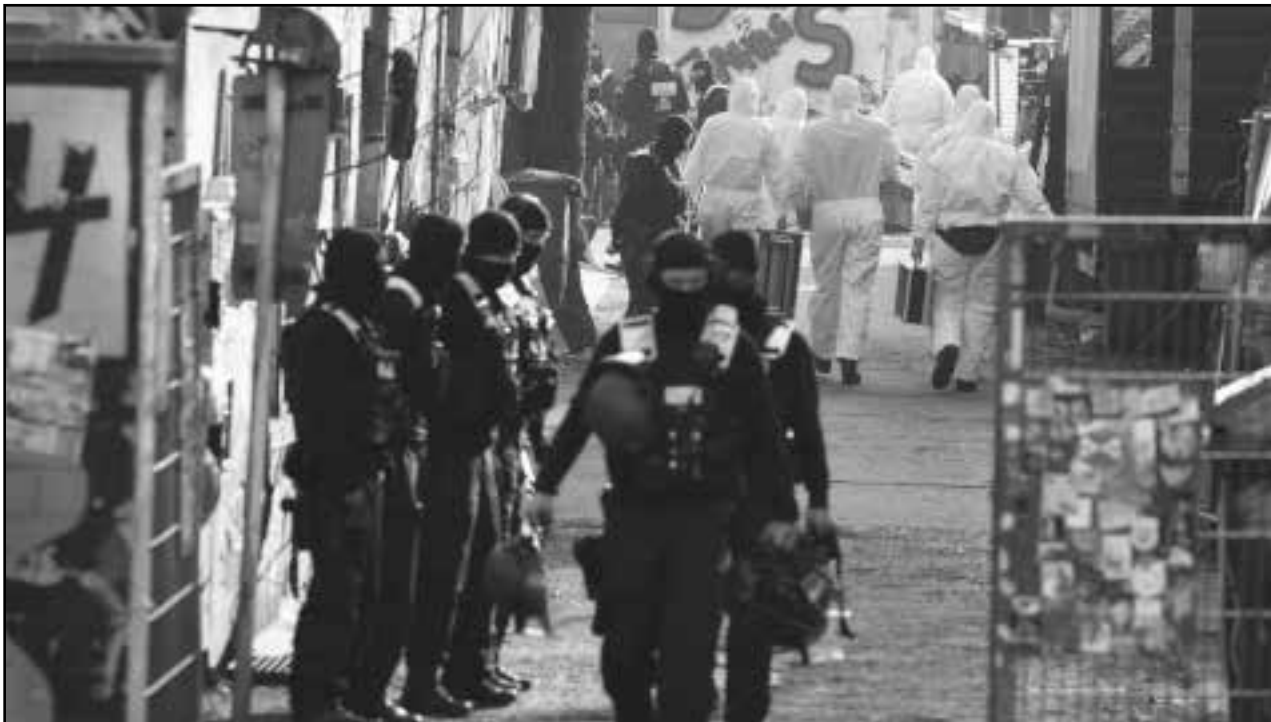
Militarized German police conducting an unsuccessful 2024 search for two fugitive former members of the one-time clandestine Red Army Faction urban guerrilla group.

In recent years, there were fresh news reports and wanted posters, as police claimed they had found DNA from the alleged RAF fugitives at the scene of various robberies in the 2000s and 2010s. Indeed, in the media/police narrative, the three were linked to a whole series of successful expropriations, several of which involved threatening armored cars with a rocket launcher before making off with the haul. All kinds of unsolved robberies