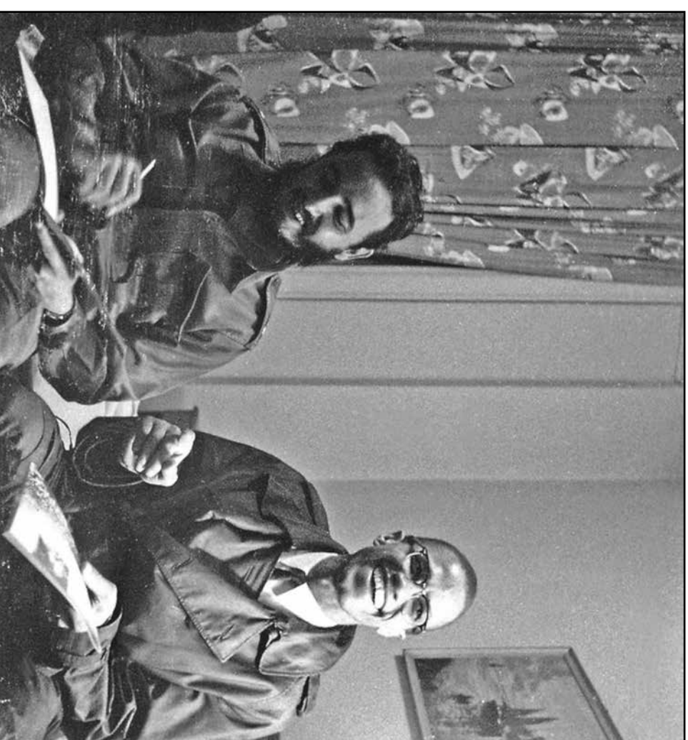
Malcolm X, born May 19, 1925, died Feb. 21, 1965, with Fidel Castro at the Hotel Teresa in Harlem NY in 1960. Live like them!

TTT published at least four times a year. No checks to Turning the Tide, please! Can't process them! Please write us every time your address changes, with your EXACT address as it should appear on the address label. TTT is a small project with few resources: we can't provide books or legal aid, or investigate individuals' innocence.