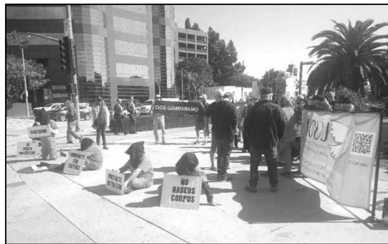
Annual ICUJP "Close Guantanamo" protest in Los Angeles at the Westwood Federal Building, Feb. 11.

Starting in 1902, Cuba was governed by President Tomás Estrada Palma. He had initially risen to prominence as a revolutionary fighting against Spanish rule, but later sought U.S. military intervention from President Theodore Roosevelt to suppress a worker-led uprising in the tobacco-rich Pinar del Río Province. Later, U.S. troops went on to fight other worker-led uprisings in different towns throughout the country. As a result, the Platt Amendment set the stage for U.S. imperialism to intervene in Cuban politics and society, giving them a base to operate on the island.