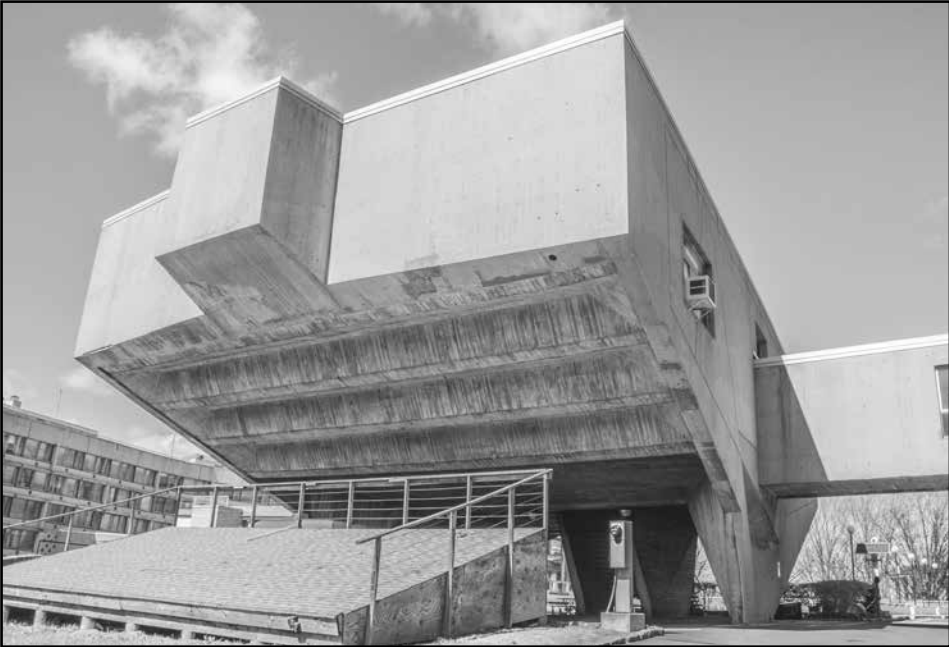
Meister Hall at Bronx Community College ironically hosted a UN Water Conference.

In April 2007, a car-sized sinkhole opened up in front