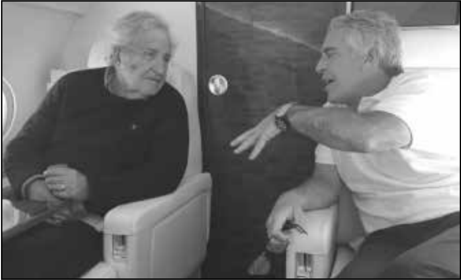
Noam Chomsky and Jeffrey Epstein on Epstein’s private plane, nicknamed the Lolita Express, in an undated photo released by Democrats in Congress. The two had a long, close relationship that continued well past Epstein’s sex crimes conviction in Florida.

While I await their response, below is the statement in case you are connected to any group that should take a stand on the issue!