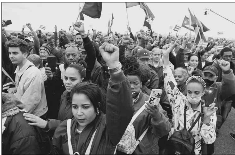
Tens of thousands of Cubans rally in Havana against US imperialist attacks.

The program—structured around ten general objectives and 106 interconnected goals—has become the framework through which the state seeks to address the crisis with the people, not over their heads.