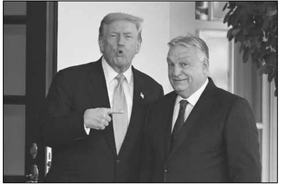
Trump fingering Orbán in happier times for both autocrats.

The incident had widespread repercussions for a party that always campaigned on protecting family values. Novák resigned — as did Varga, who had also signed the pardon in her role as justice minister. At that point, Magyar, leveraging his perspective as a former insider, started publicly criticizing Orbán's government. In an viral video interview with the Hungarian outlet Partizán in 2024, he accused the government of corruption and of scape-goating female leaders like his ex-wife, saying he didn't want to be part of a system where the "real culprits hide behind women's skirts." Months before the European Parliament election in June 2024, he revived