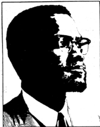
I BELIEVE THAT THERE WILL ULTIMATELY BE A CLASH BETWEEN THE OPPRESSED AND THOSE WHO DO THE OPPRESSING. I BELIEVE THAT THERE WILL BE A CLASH BETWEEN THOSE WHO WANT FREEDOM, JUSTICE AND EQUALITY FOR EVERYONE AND THOSE WHO WANT TO CONTINUE THE SYSTEM OF EXPLOITATION. I BELIEVE THAT THERE WILL BE THAT KIND OF CLASH, BUT I DON'T THINK IT WILL BE BASED ON THE COLOUR OF THE SKIN... Malcolm X

We feel strongly that Malcolm X was one of the leading liberation thinkers and leaders for all people in this century. His message of empowerment and national self-