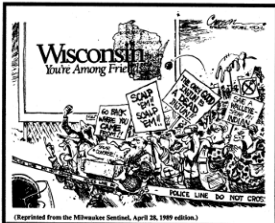
(Reprinted from the Milwaukee Sentinel, April 28, 1989 edition.)

DEFEND NATIVE NATIONS' SOVEREIGNTY! SUPPORT TREATY RIGHTS! FIGHT ANTI-INDIAN RACISTS LIKE "P.A.R.R."!